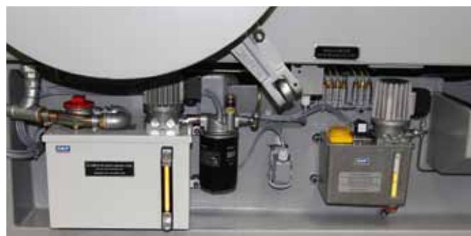
▼ Maintenance unit and automatic central oil lubrication