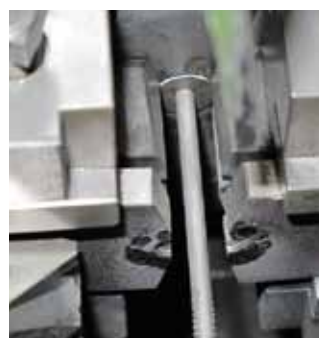
▼ Processing of twisted wire