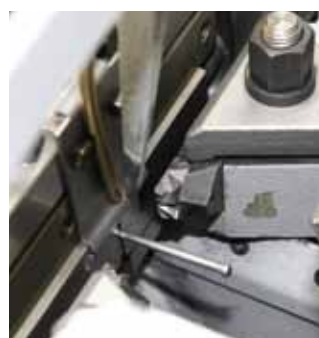
▲ Production of blind rivets