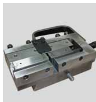
▲ Jaw box (exchangeable)